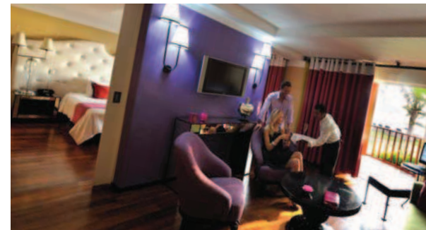
Sol, Luxury Suite