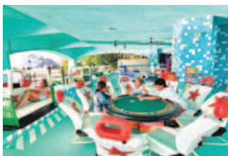
Club Med Passport®