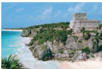
Excursion* to Tulum