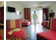
Deluxe Room - Ocean View These rooms (344 ft 2 ) have lounge areas and views over the turquoise waters of the Caribbean.