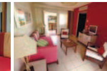
Suite - Ocean View Large Suites (463 ft 2 ) with fully furnished lounges, offering luxurious comfort and magnificent views.